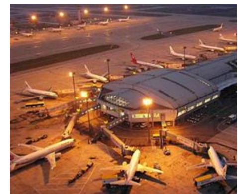
Airport/highway (High mast lighting)