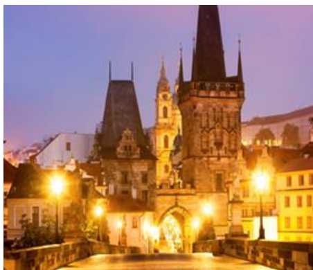
Street Light (HPS retro fit)